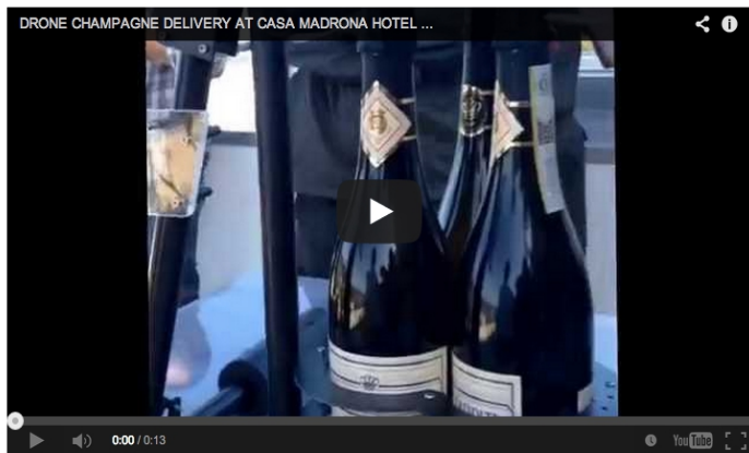
And job well done, though could have been lot easier with a human.